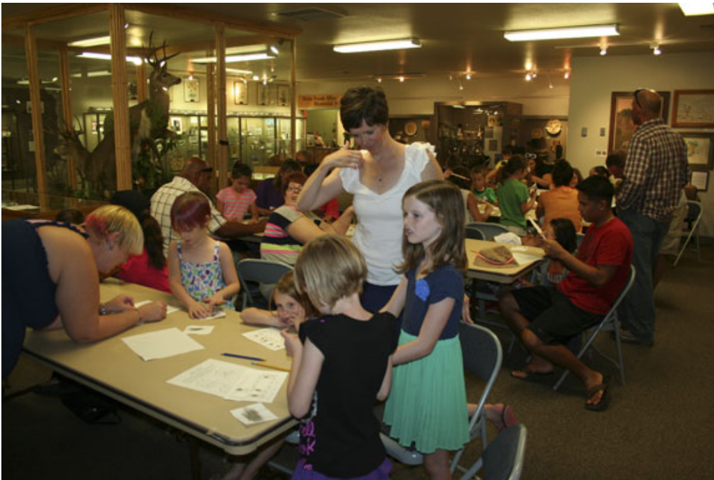
A capacity crowd of kids enjoys a fingerprinting exercise at the Hi-Desert Nature Museum's Science Saturday on the subject of Genetics and Fingerprints.